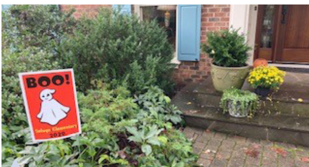
The Selwyn Elementary PTA sold "Boo" yard signs to benefit CIS.

CIS was thrilled to have two community partners reach out to us this fall with plans to hold fundraising events on our behalf. The PTA at Selwyn Elementary School sold Halloween "Boo!" yard signs to friends and family and donated the proceeds to CIS. We've seen lots