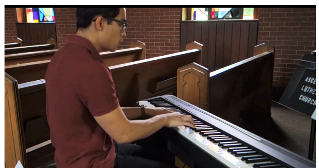
Ascension Lutheran Church hosted a jazz trio concert on behalf of CIS.

of these cute signs in many a front yard during October! And on October 9, Ascension Lutheran Church organized a jazz-trio concert, "The Hymnal Meets Jazz," with ticket sales benefiting CIS. Many thanks to both of these new CIS partners!