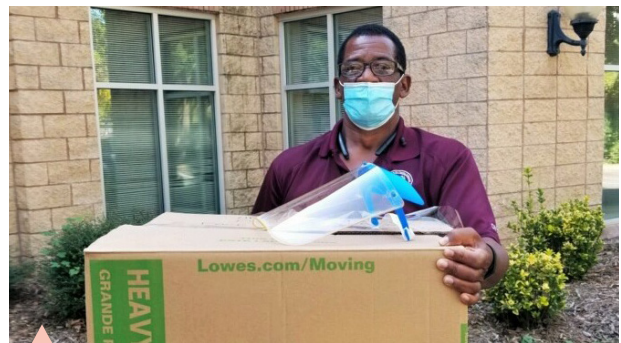
The Urban League donated 121 face shields to CIS.