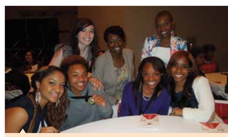
CIS staff (back row) with seniors from Independence High School at our annual Celebrating Our Graduates event.

Spring is a busy but joyful time for CIS students, families and staff! All of our programming teams take great pleasure and pride in planning end-of-year events to recognize their students who have excelled or made great improvement in academics, attendance, citizenship, and leadership. Parents and guests attending the events were duly impressed with the creativity and execution of the