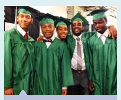
Myers Park High School