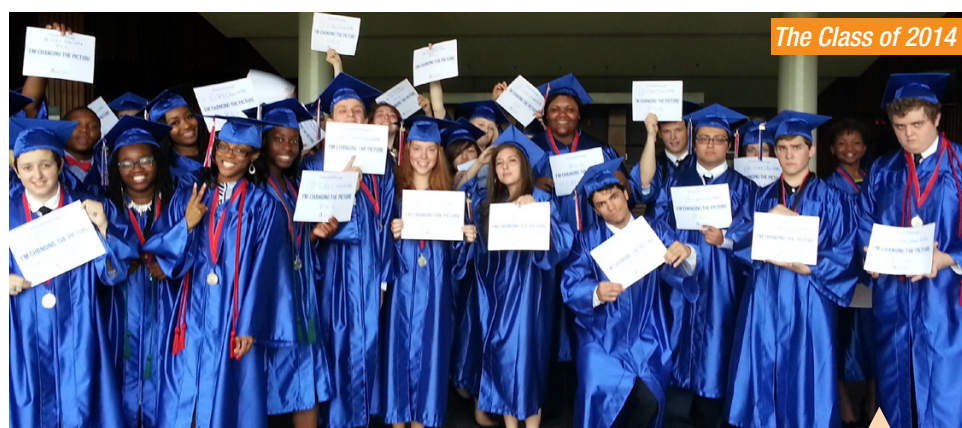
The Class of 2014

Graduates from Charlotte's Performance Learning Center (PLC).