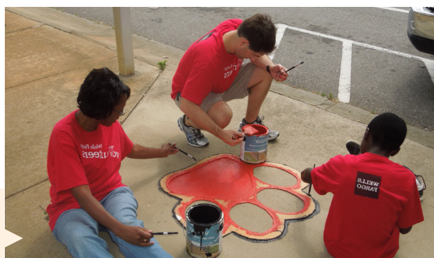
TOP: Deloitte IMPACT Day Volunteers at Myers Park High School BOTTOM: Wells Fargo employees at Highland Renaissance Academy