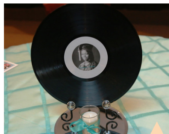
Keepsake “photo album”

Let us state – for the record – that creativity was king (or queen?) at Safe Journey’s graduation celebration on May 29! The event’s “For the Record...” theme was carried out by our Safe Journey staff in multiple clever ways, from the album “covers” that served as programs, to the vinyl 33rpm